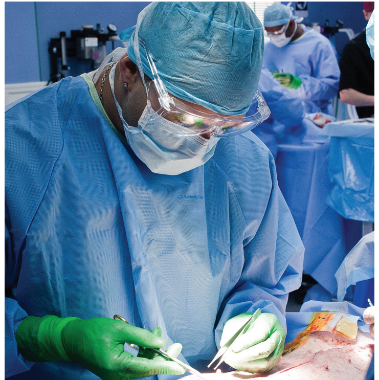
Students at Meridian Institute of Surgical Assisting, practice their suturing skills in a hands-on lab environment.